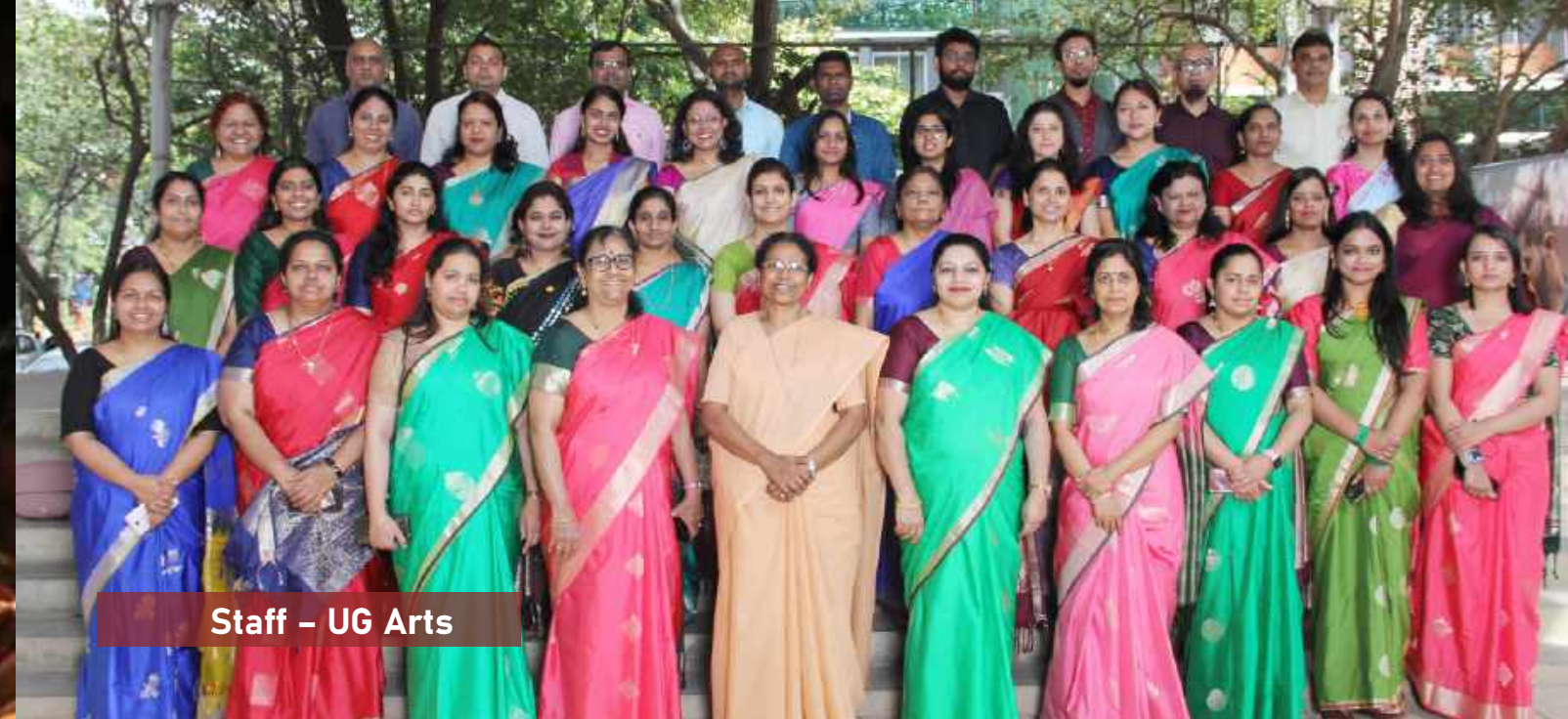
Staff – UG Arts

Teaching here is not just a vocation but a passion for our faculty members.