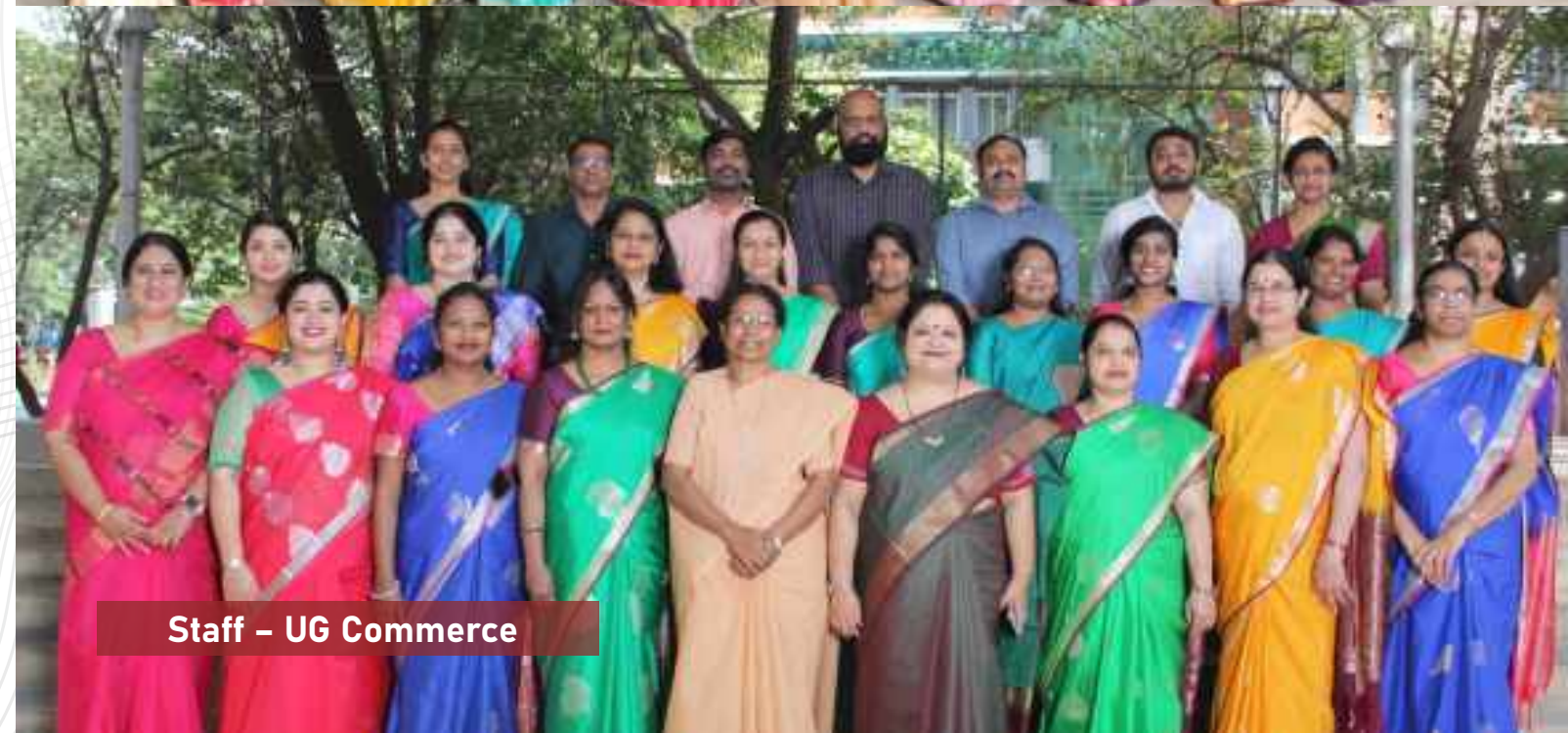
Staff – UG Commerce