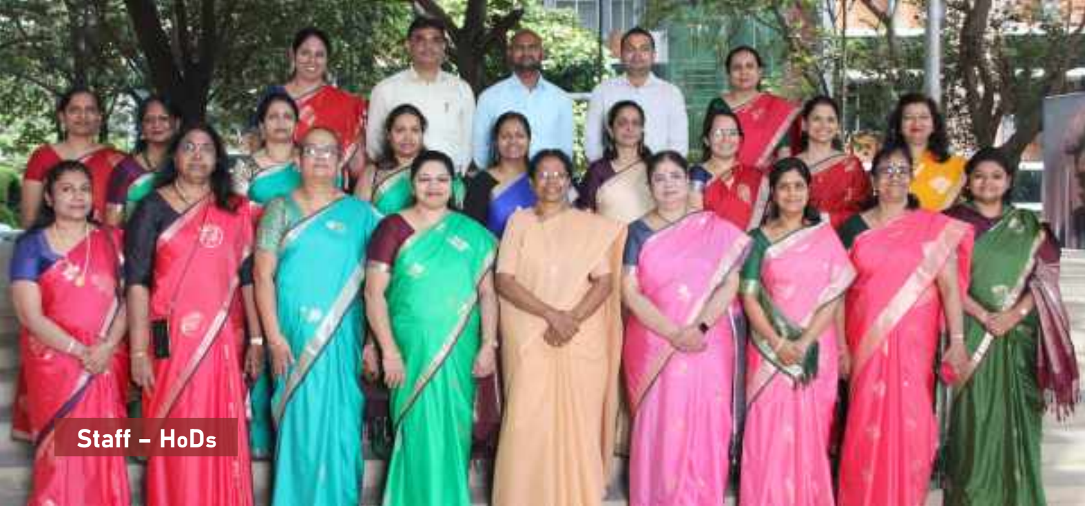
Staff – HoDs