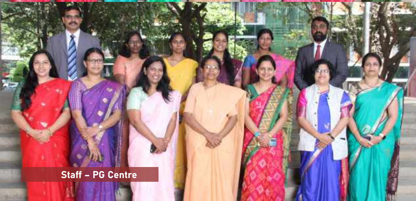
Staff – PG Centre