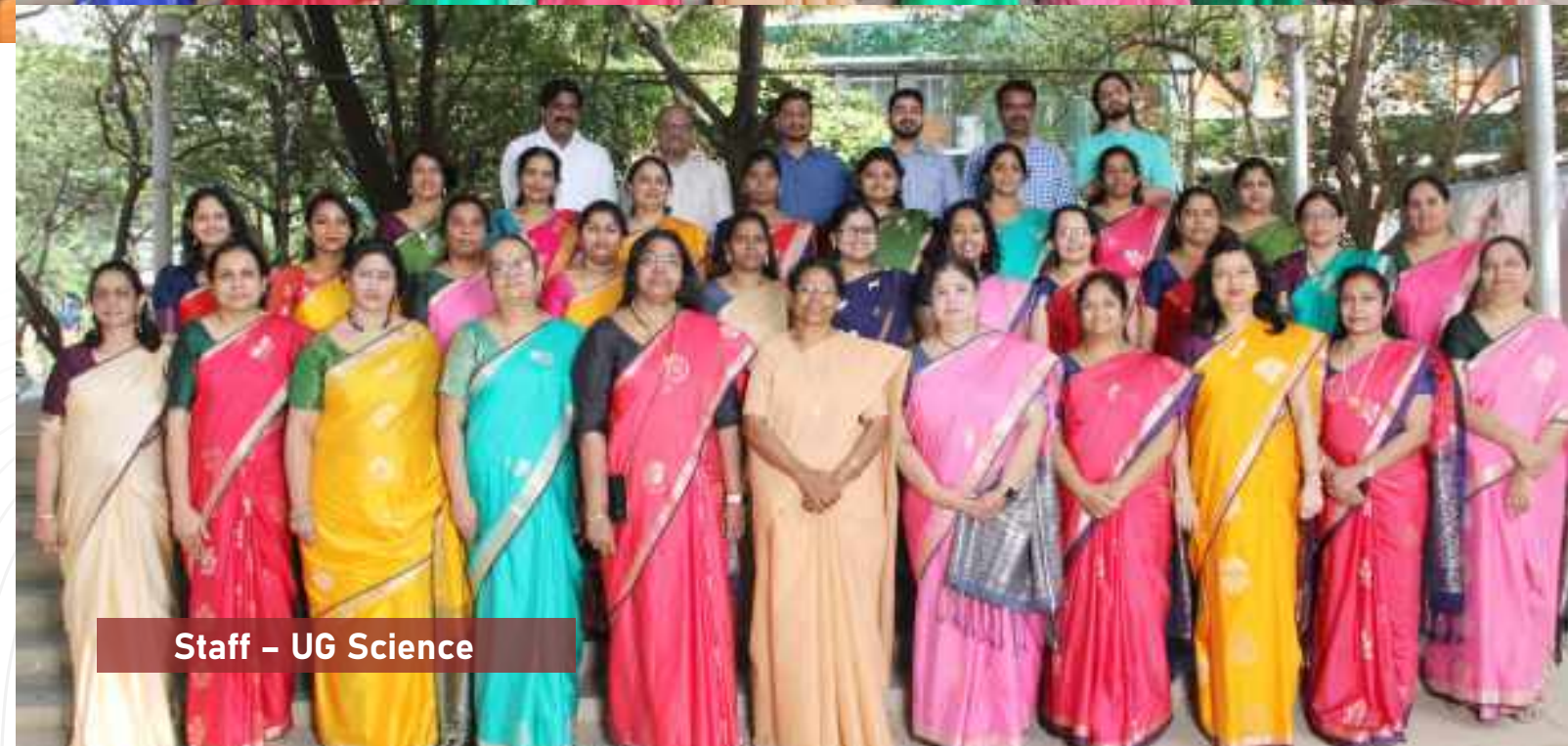
Staff – UG Science